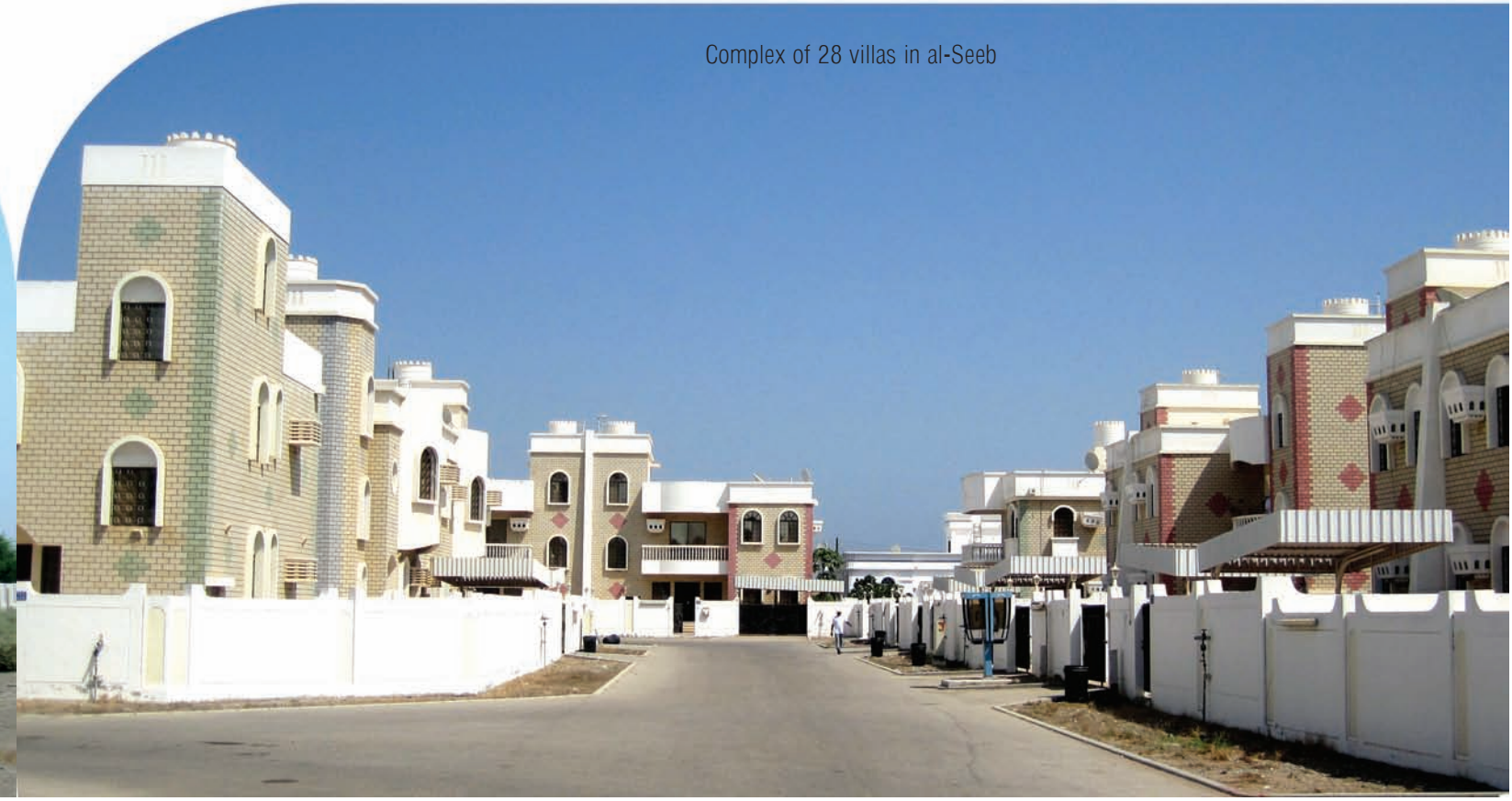
Complex of 28 villas in al-Seeb