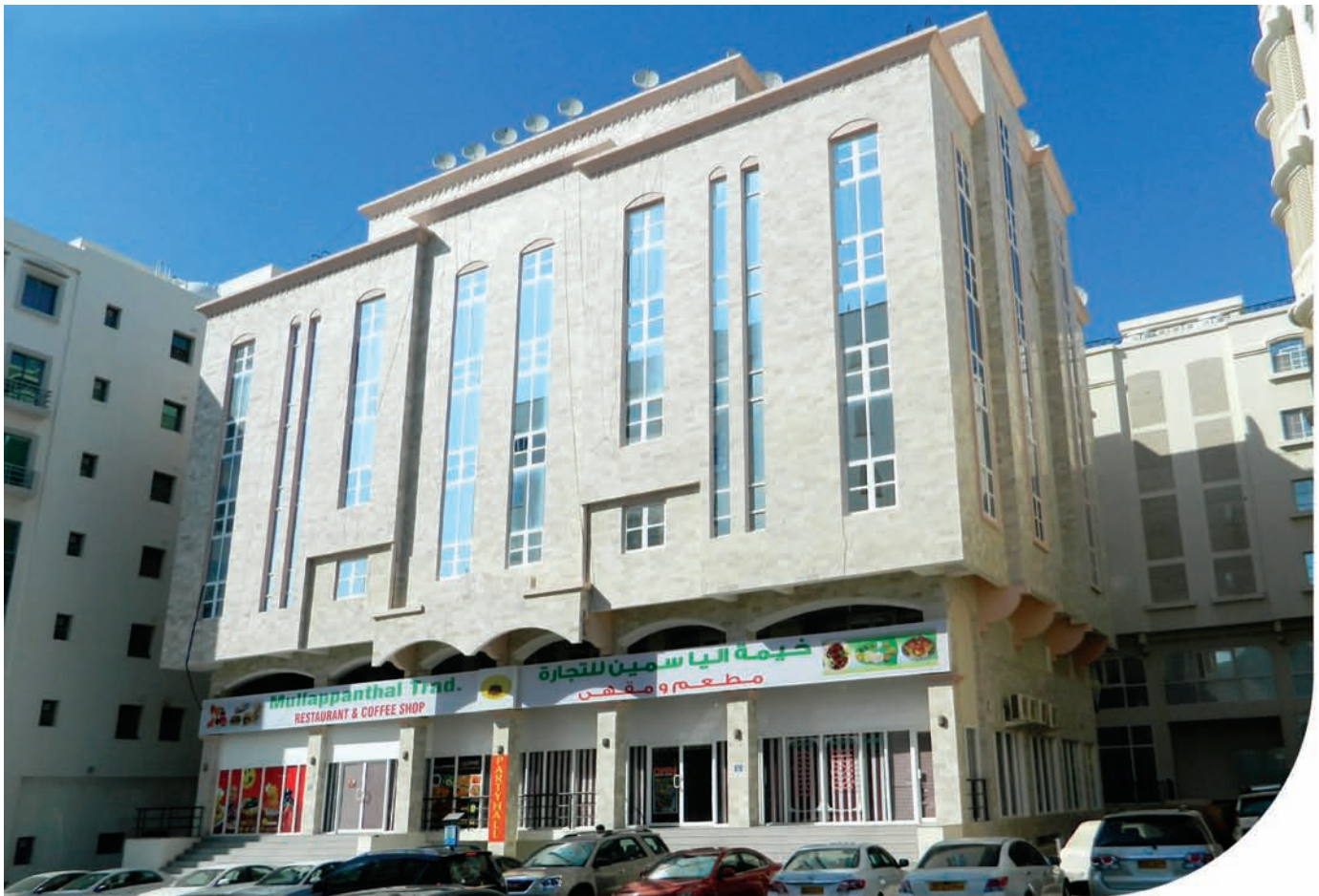
Commercial cum Residential building at MBD