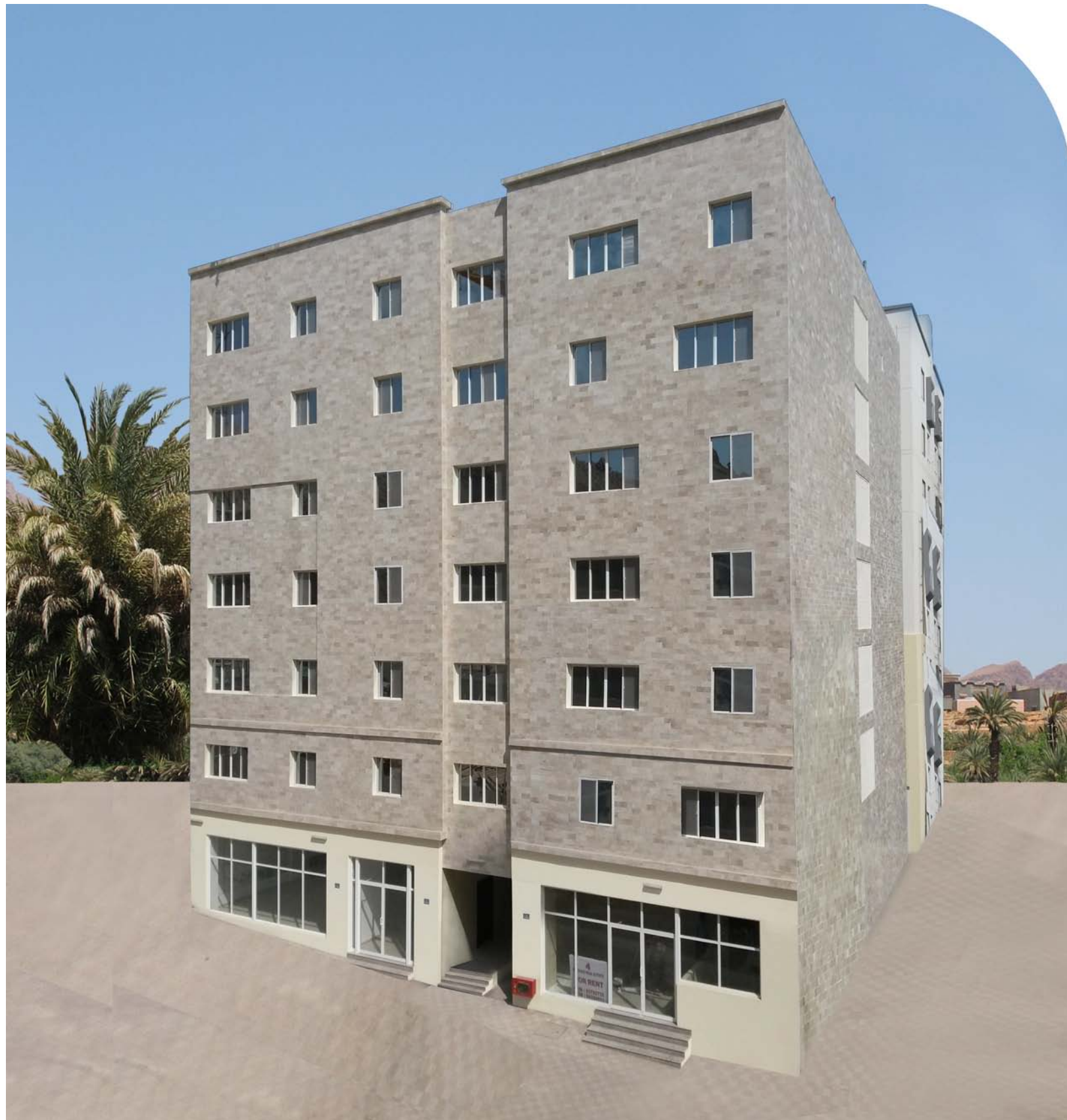
Commercial cum residential building at Mumtaz Area