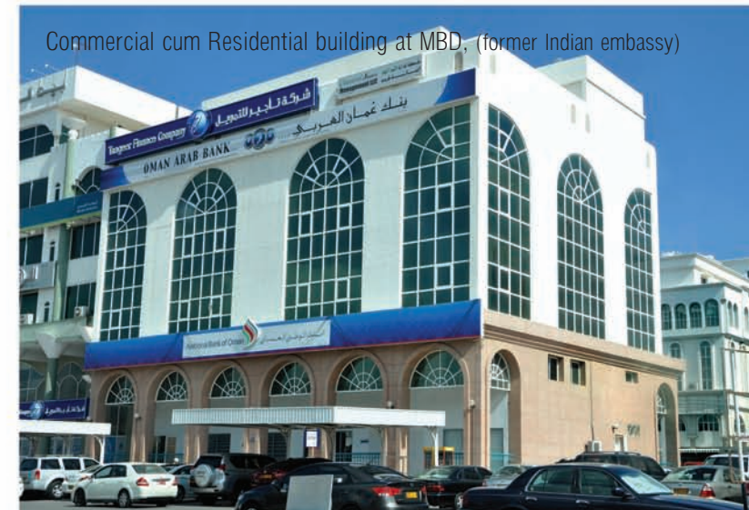
Commercial cum Residential building at MBD, (former Indian embassy)