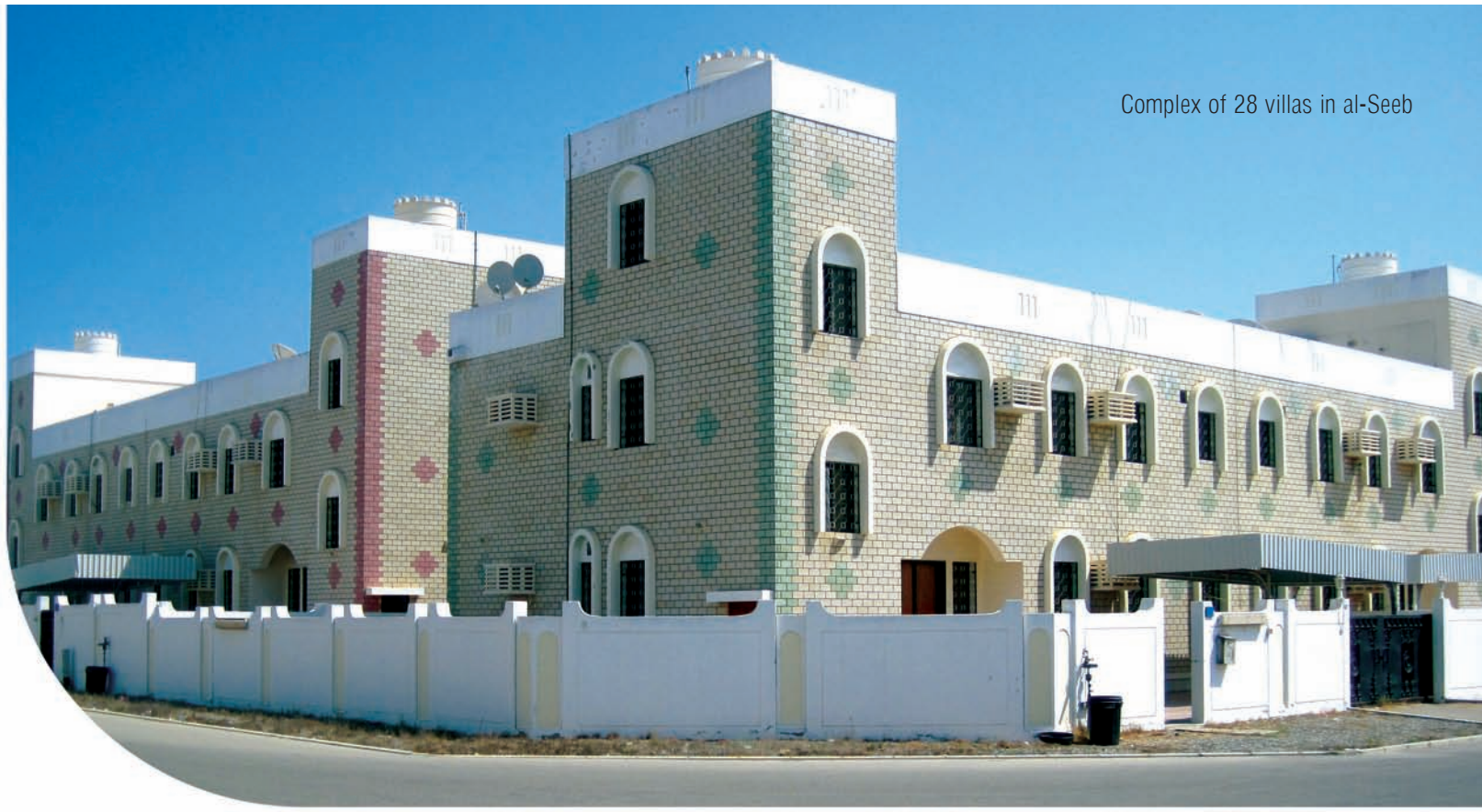
Complex of 28 villas in al-Seeb