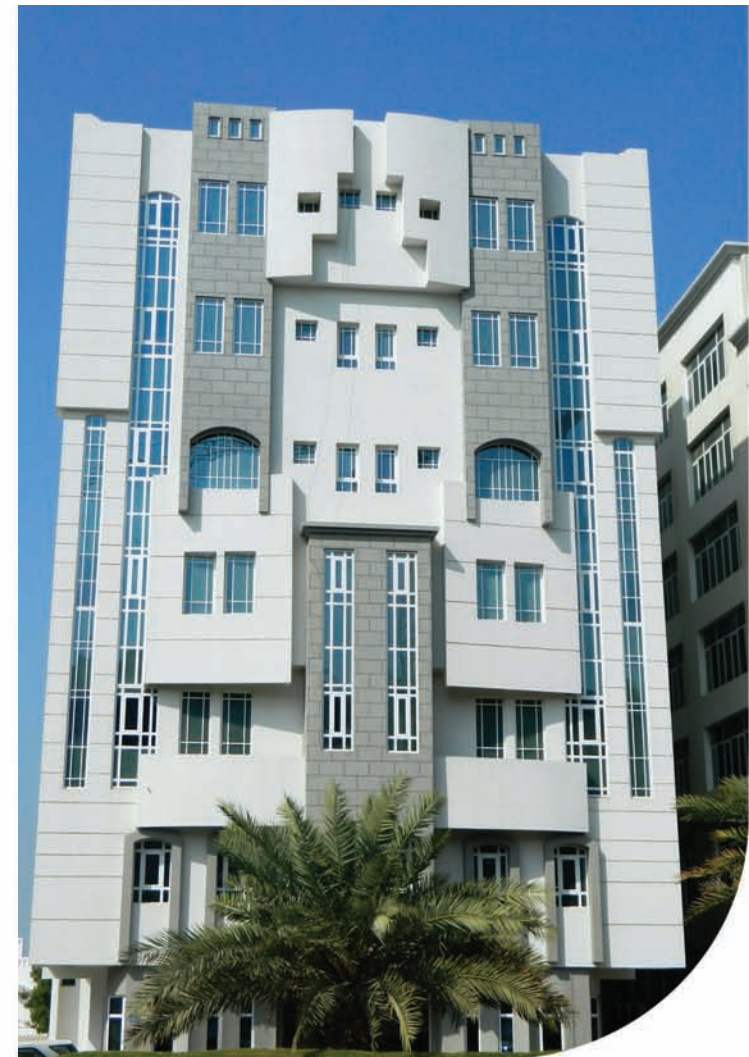
Commercial cum Residential building at Bausher