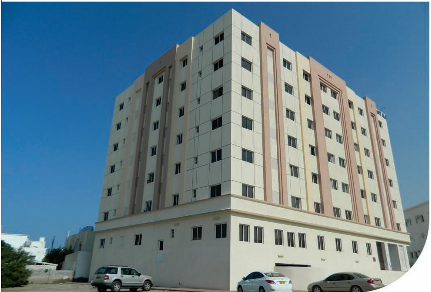
Residential building in al-Ghubrah (behind Waleed Pharmacy Head office)