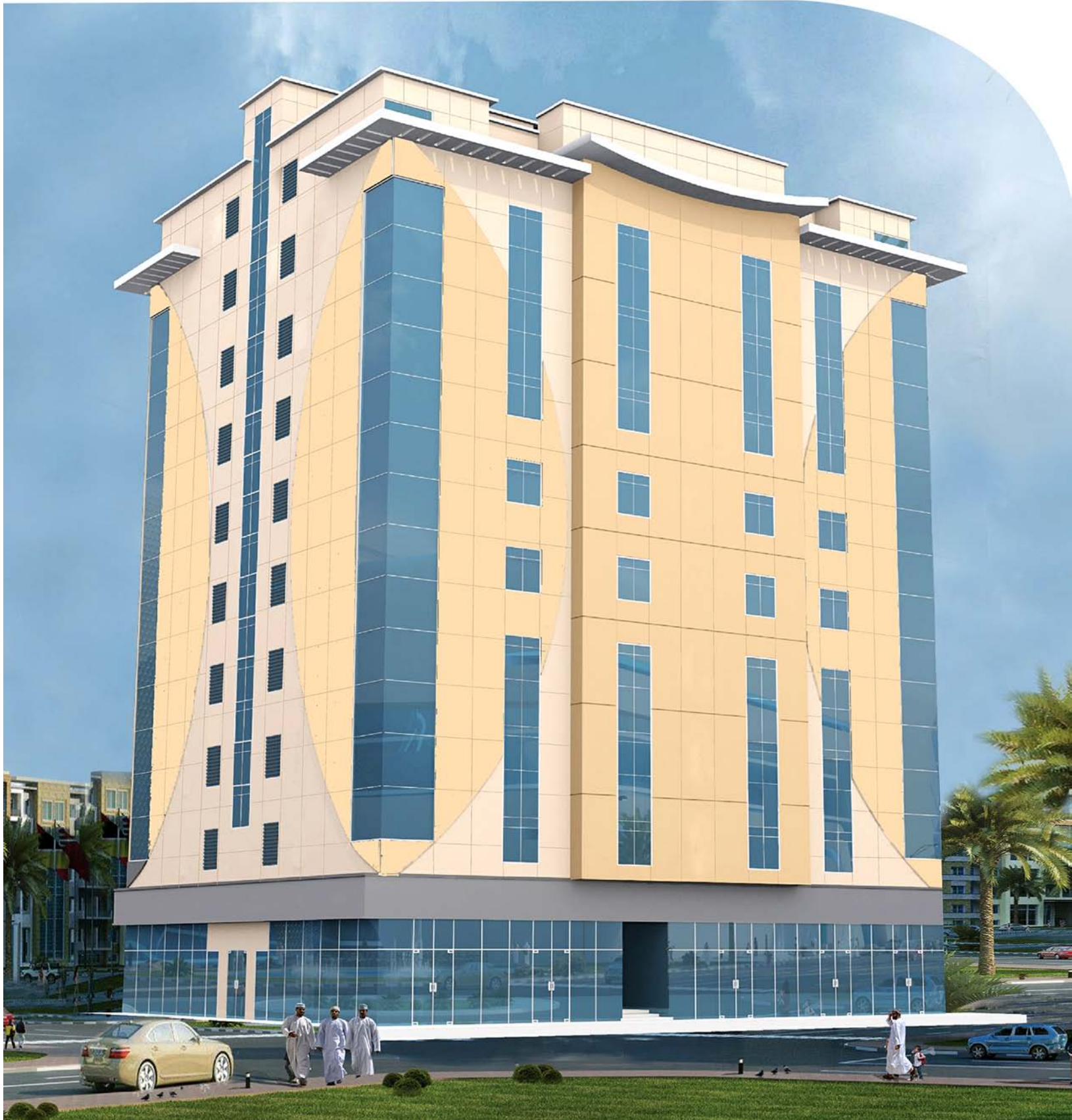
Commercial cum residential building at Ghala, behind Al-Turki Enterprises corporate office (Ongoing)