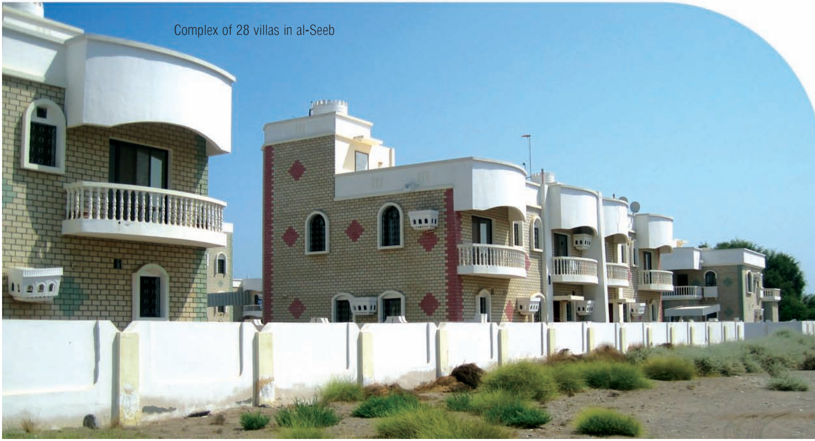
Complex of 28 villas in al-Seeb