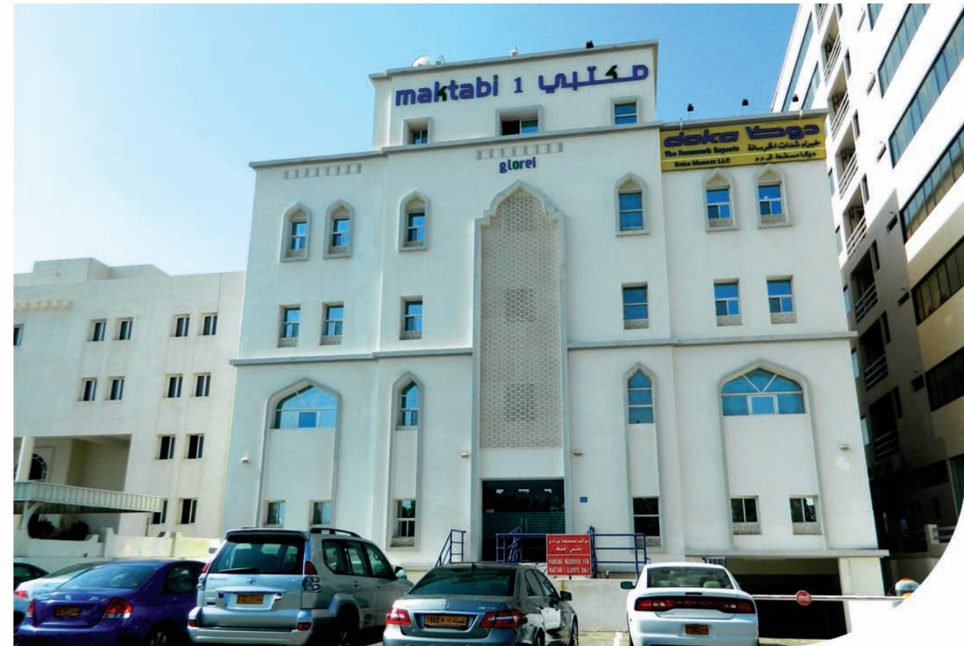
Commercial building in al-Khuwair (near Zakher mall)