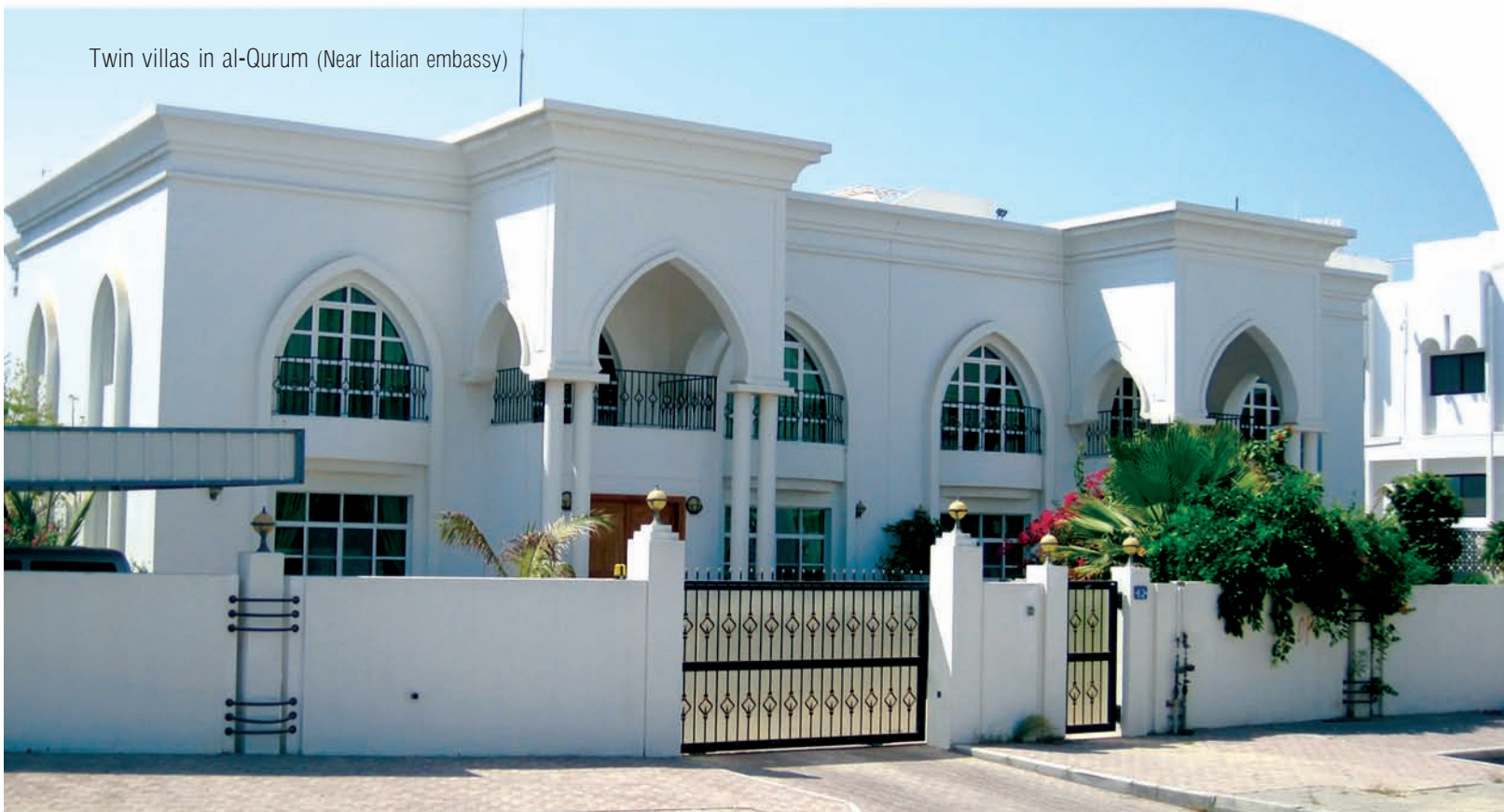
Twin villas in al-Qurum (Near Italian embassy)