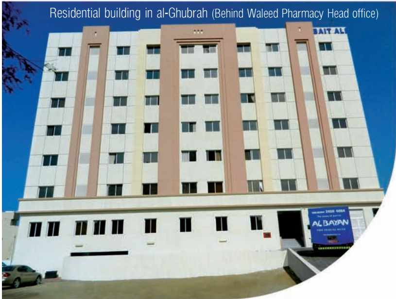
Residential building in al-Ghubrah (Behind Waleed Pharmacy Head office)

The company believes its dedicated capabilities as a vital component of its business strategy that will provide a sustainable and long-term competitive advantage. It has an excellent and experienced team of well trained and well equipped professionals engaged in never ending research for accomplishing their client's requirements.