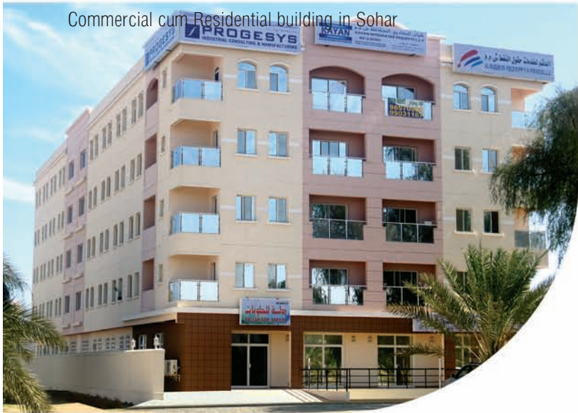
Commercial cum Residential building in Sohar

We have a strong vision to provide high quality life style experiences to our consumers with maximum economic advantages. With our reliable team work, we can accomplish this mission with trouble-free efforts. The highly sophisticated mechanical and workmanship facilities add more advantages to the company to impress the market strategies and expand its wings to newer heights.